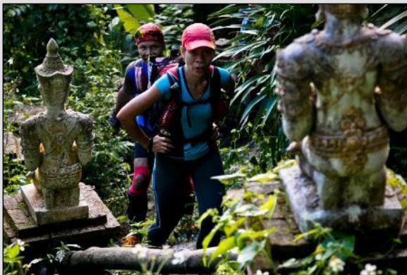
Wat Palaad temple