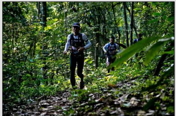
Run in the jungle