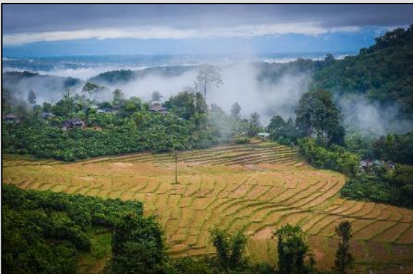
DAY 1 Karen village