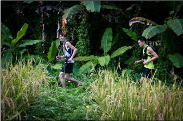
DAY 1 Running in the rice paddies