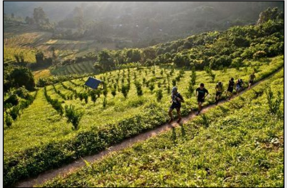
DAY 2 Leaving Mae Kha Piang