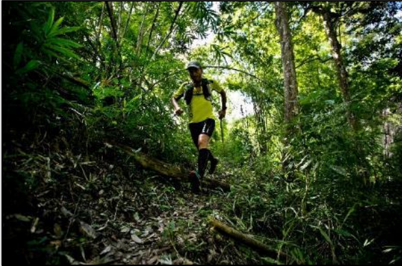
DAY 1 Welcome to the jungle