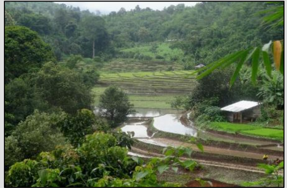
DAY 2 The Karen valleys