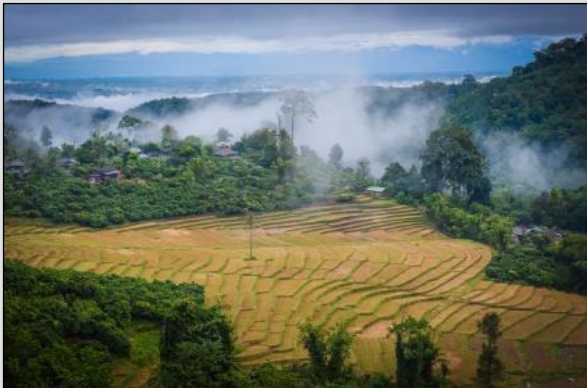
DAY 2 The Karen valleys