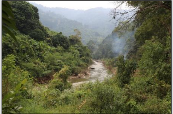
DAY 4 Mae Taeng river