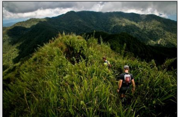
DAY 5 The Lahu high country