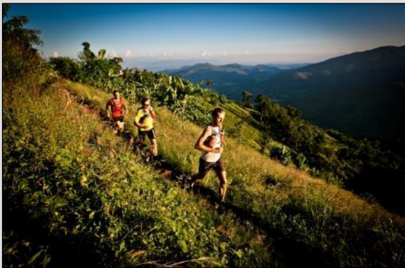
DAY 3 The Hmong high country