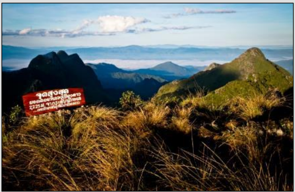
DAY 1 View at the summit