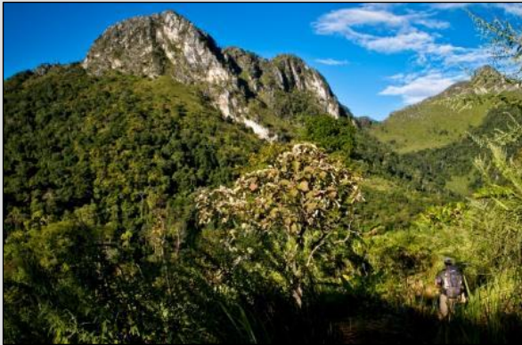
DAY 1 Up to the summit