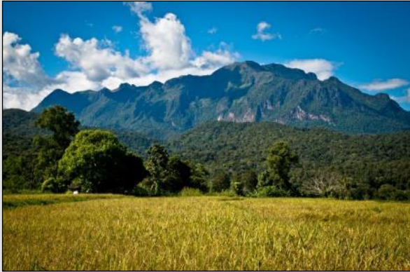
DAY 1 The foothill of Chiang Dao