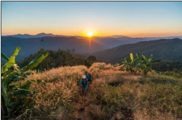
DAY 2 Hill-top Lahu village