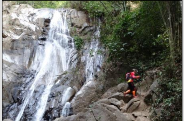
Mae Taeng river & waterfall