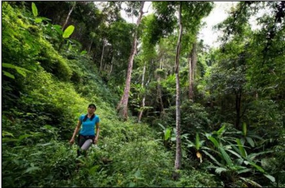
DAY 1 The jungle of Sop Kai