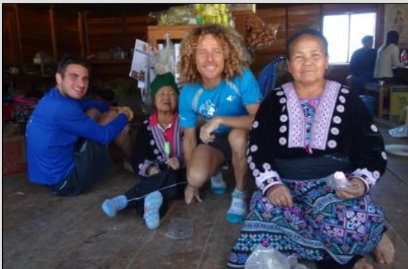
DAY 3 Hill-top Hmong village