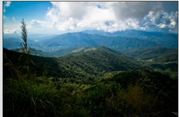
The summit of Pha Sam Liam